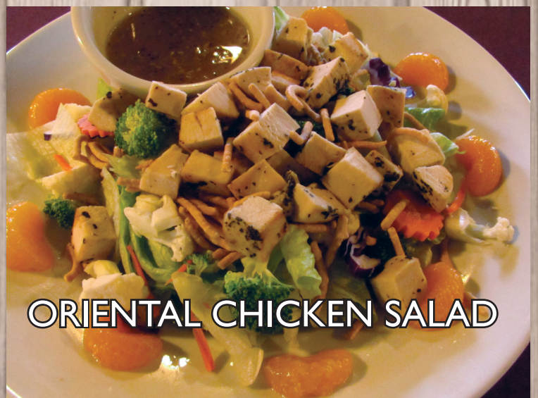
ORIENTAL CHICKEN SALAD