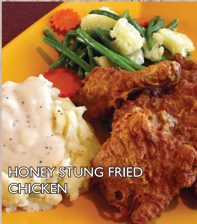
HONEY STUNG FRIED CHICKEN

Large black tiger prawns sauteed with mushrooms, garlic, onion and a splash of white wine. 17.99