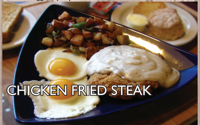
CHICKEN FRIED STEAK